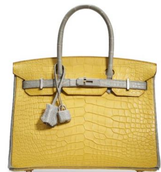
HERMÈS, 2017 A CUSTOM MATTE MIMOSA & GRIS PERLE ALLIGATOR BIRKIN 30 WITH BRUSHED PALLADIUM HARDWARE PRICE REALIZED: $50,000