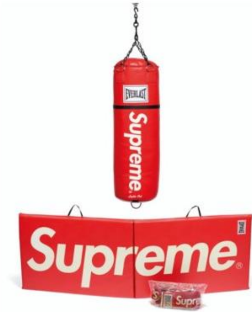
SUPREME AN EVERLAST BOXING GROUP PRICE REALIZED: $17,500