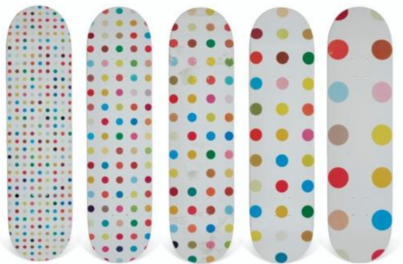
SUPREME, 2009 A SET OF FIVE DAMIEN HIRST DOTS SKATEBOARDS PRICE REALIZED: $15,000