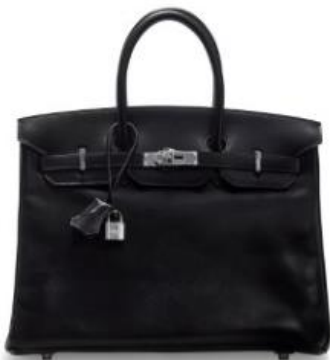
HERMÈS, 2011 A LIMITED EDITION BLACK CALFBOX LEATHER SO BLACK BIRKIN 35 WITH BLACK PVC HARDWARE PRICE REALIZED: $37,500