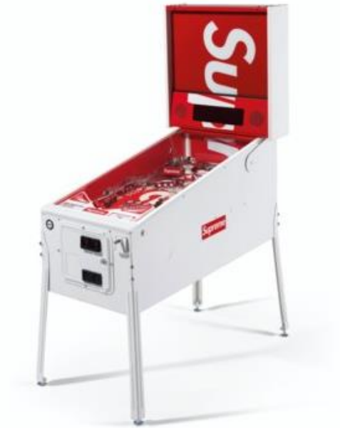
SUPREME A STERN PINBALL MACHINE PRICE REALIZED: $32,500