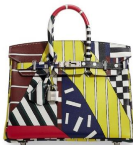
HERMÈS, 2018 A LIMITED EDITION MULTICOLOUR SWIFT LEATHER ONE TWO THREE & AWAY WE GO BIRKIN 25 WITH PALLADIUM HARDWARE BY NIGEL PEAKE PRICE REALIZED: $47,500