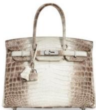
HERMÈS, 2017 A RARE, MATTE WHITE HIMALAYA NILOTICUS CROCODILE BIRKIN 30 WITH PALLADIUM HARDWARE PRICE REALIZED: $125,000