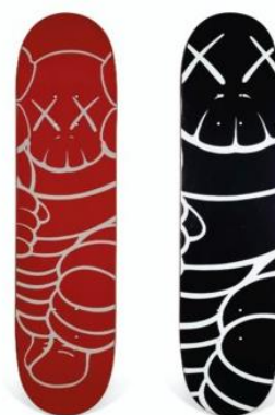
SUPREME, 2001 A SET OF TWO SIGNED KAWS CHUM SKATEBOARDS PRICE REALIZED: $32,500

New York – Christie's online sale of Handbags X HYPE, featuring a Collection of SUPREME Skateboards & Accessories , totaled $2,164,875 with 89% sold by lot. There was global participation represented with bidders across 22 countries. The top two lots of the sale were a Hermès matte white Himalaya Niloticus Crocodile Birkin 30 with palladium hardware, which sold for more than double its low estimate realizing $125,000 ; and the Supreme x Louis Vuitton Monogram Malle Courrier 90 Trunk , which also doubled its low estimate selling for $125,000 .